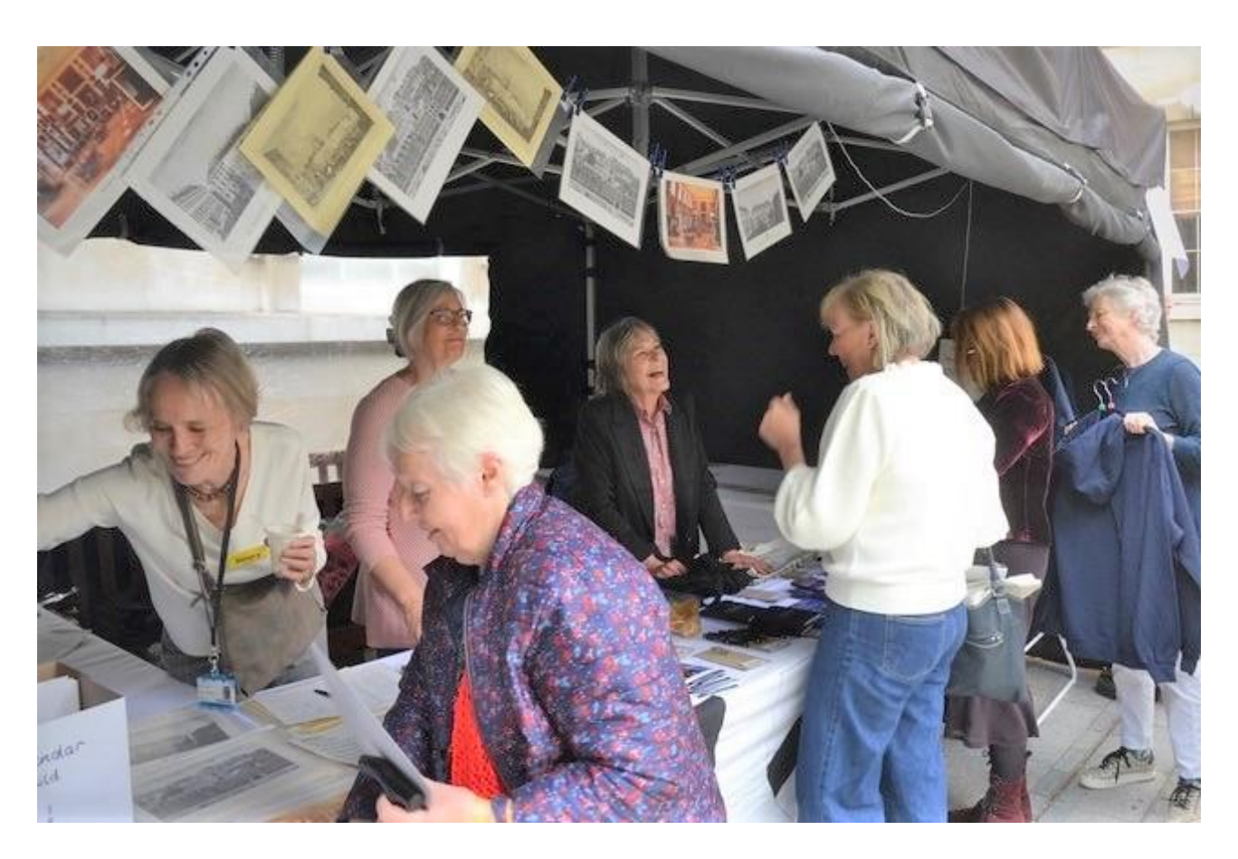
Plenty of space, plenty to sell and plenty of customers at the Guild's View Day stall