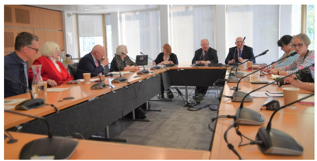
The Guild's Management Committee in meeting