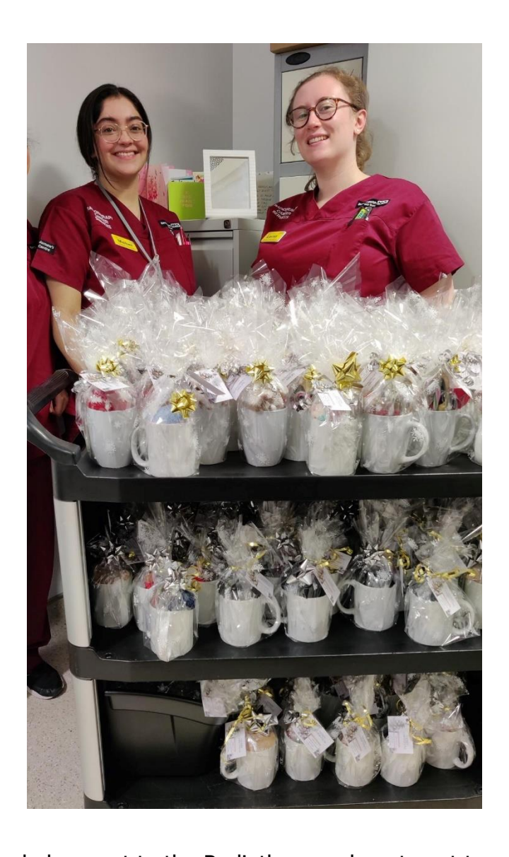
Barts Guild awarded a grant to the Radiotherapy department to provide presents for patients who attended Clinic on Christmas Eve 2022.