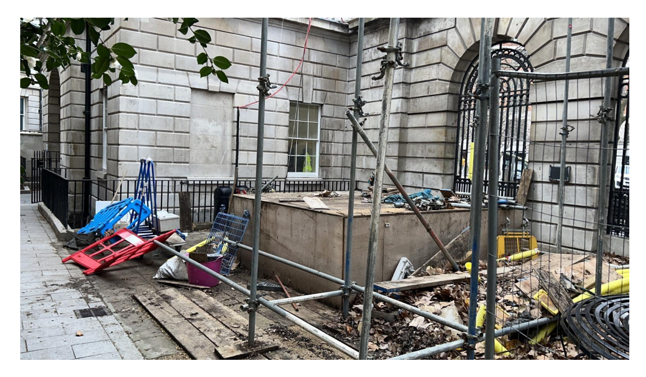
A sorry state of affairs in the barely-recognisable Princess Alice Garden ...

Works are progressing; the new surface is being laid but trouble lies ahead and underground!