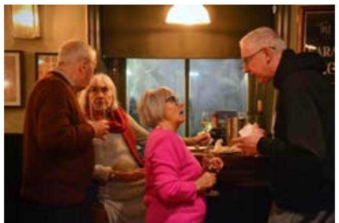
Cool drinks and hot gossip.

Happily, volunteers and members of the Management Committee were able to congregate at the Lord Raglan pub in December of last year for an evening of Christmas cheer in the best of company – another welcome return to the Guild's calendar.