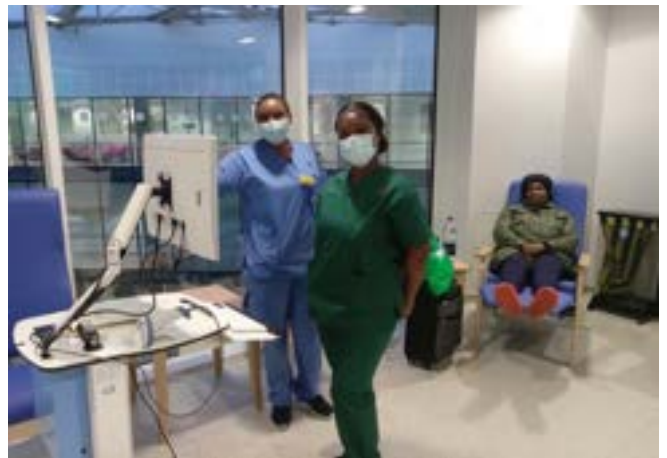
Staff with the new furniture in the Discharge Lounge.