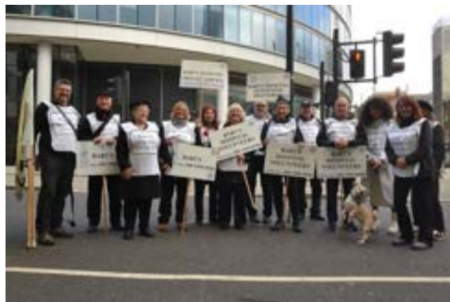
Ready for the off.

This year's Show will be on Saturday 11 November, so put the date in your diary and come and join in for an unforgettable experience. Your friends and family would be very welcome to join us, so rope them in so that the Guild can have a magnificent turnout during this very special year.