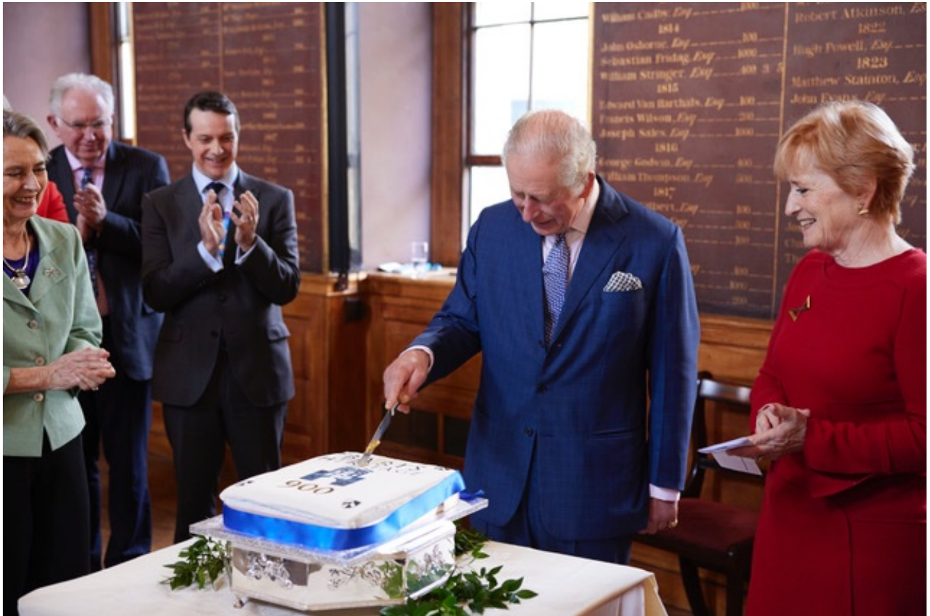
His Majesty King Charles III cuts a celebratory cake in the Great Hall, November 2022.