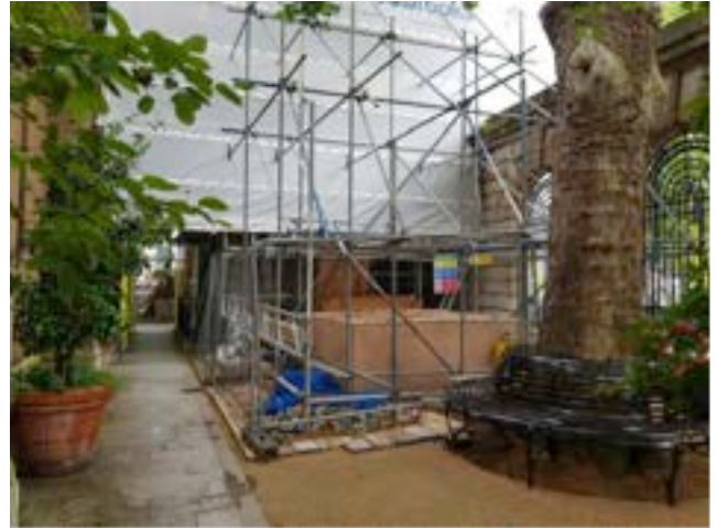
Scaffolding encroached into the Princess Alice Garden.