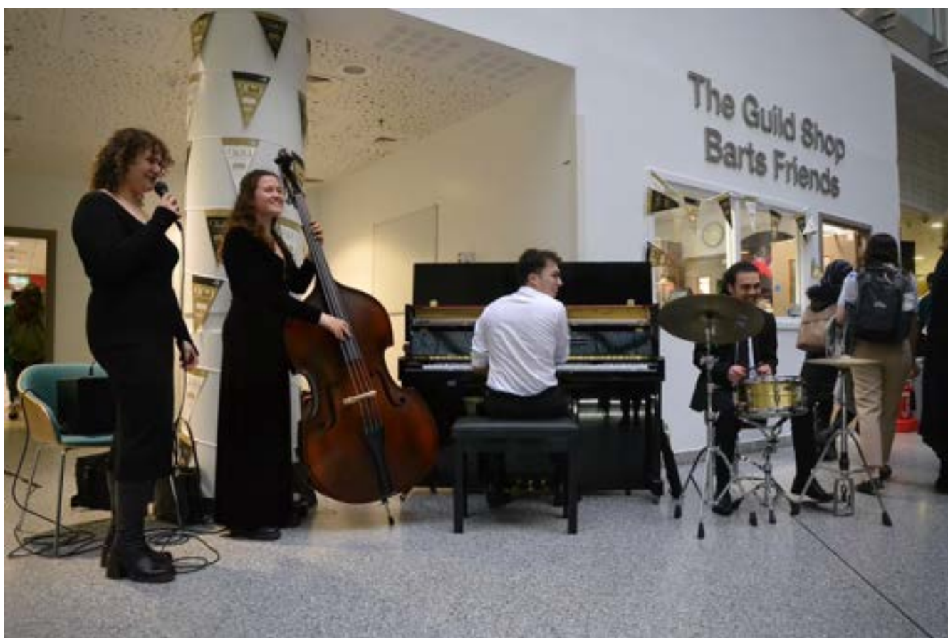
A little light music.