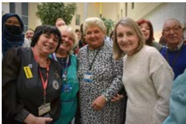
Guild Volunteers join in the fun.