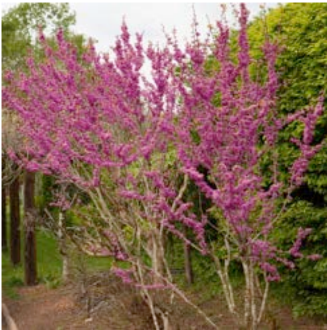
A Cercis tree in full bloom.

During the course of the past year, we planted a Cercis in the Princess Alice Garden to support the late Queen Elizabeth's 'Plant a Tree for the Jubilee' initiative.