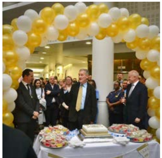
Sir Michael Palin cutting the cake.

Sir Michael expressed his thanks to Barts for the treatment he had received at the hospital saying that Barts would always be in his heart – “especially in the aortic artery”. Sir Michael was invited to cut the birthday cake. He brandished the very large knife and raised a roar of laughter when he asked: “Is there a surgeon in the house?”