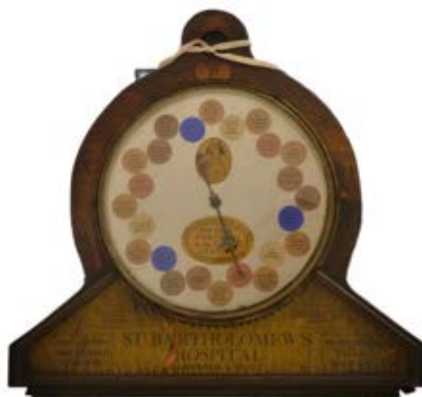
Primitive AI diagnosis? No - a fund-raising slot machine.