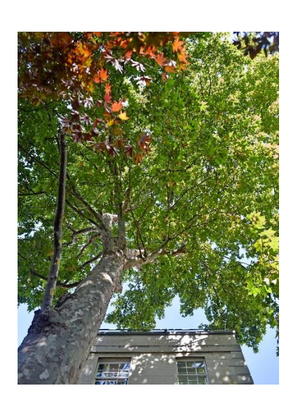
Tree canopy, Princess Alice Garden