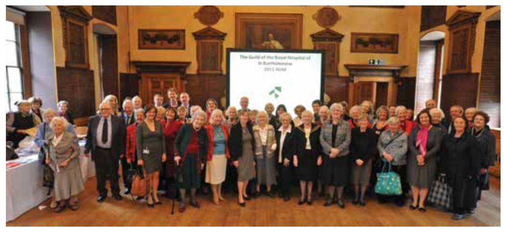
The gathering of so many members of the Guild on this special occasion provided an ideal opportunity for a group photograph!

history', such as the Peasants' Revolt and the Black Death, and went on to tell the story of Barts and the part played in it by supporters and benefactors.