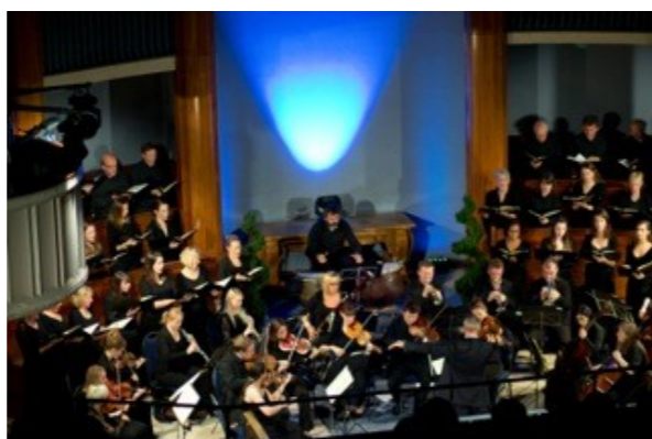
Barts Chamber Choir and the Trafalgar Sinfonia

We were fortunate in securing substantial support for the event from financial services group, Saunderson House Limited. Their generosity made a great difference to the funds raised for our charity through ticket sales. Skanska also made a donation towards the cost of the event and there were further donations from C. Hoare & Co. the eminent independent bank and the law firm Hogan Lovells International LLP. Hogan Lovells also kindly met the significant cost of designing and printing programmes for the concert.