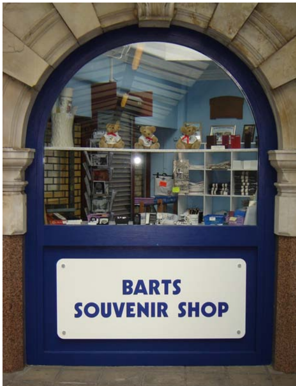
The new shop

Within weeks Lloyds Banking Group staff rolled up their sleeves and set