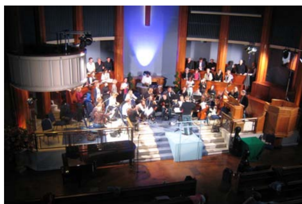
The choir and orchestra in rehearsal

Journalist and broadcaster, Henry Kelly (below), gave his services as Compere for the evening. Henry gleefully shared his knowledge of music with the audience, greatly adding to everyone's enjoyment of the concert.