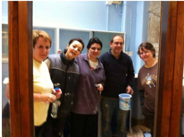
Lloyds Banking Group Volunteers at work in the shop

Not content with refurbishing the shop the Lloyds Banking Group volunteers are helping out by running book sales at Barts and fundraising for the Guild by holding cake sales and other fun activities in their offices.