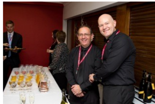
Volunteers ready for action

Front of house duties were undertaken by a team of young volunteers including Barts medical students and staff from the offices of our sponsors and Lloyds Banking Group. The team acted as ushers and waiters, sold programmes and enthusiastically rattled collecting boxes.