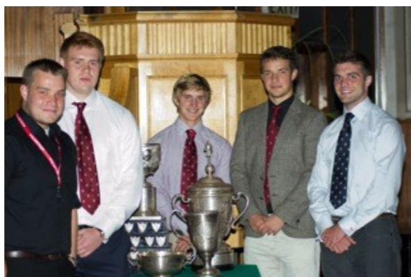
Barts rugby stars take a bow

Students from the Medical School provided an entertaining interlude by displaying the trophies that the Rugby team had won in this year's Triple Crown.